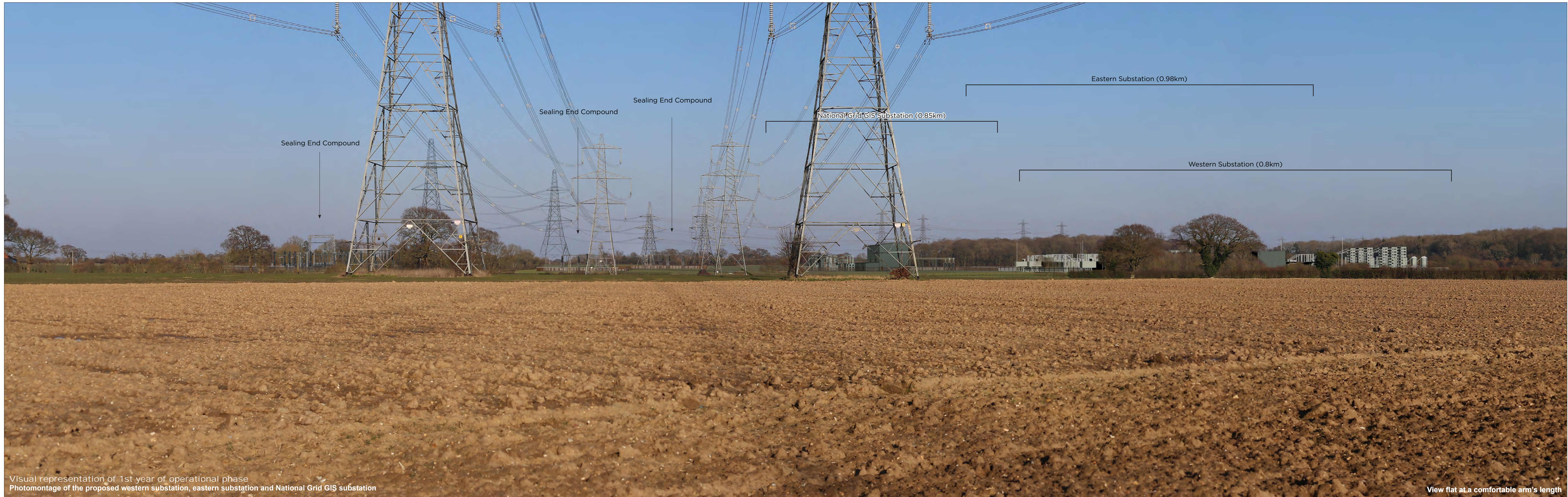
Visual representation of 1st year of operational phase Photomontage of the proposed western substation, eastern substation and National Grid GIS substation