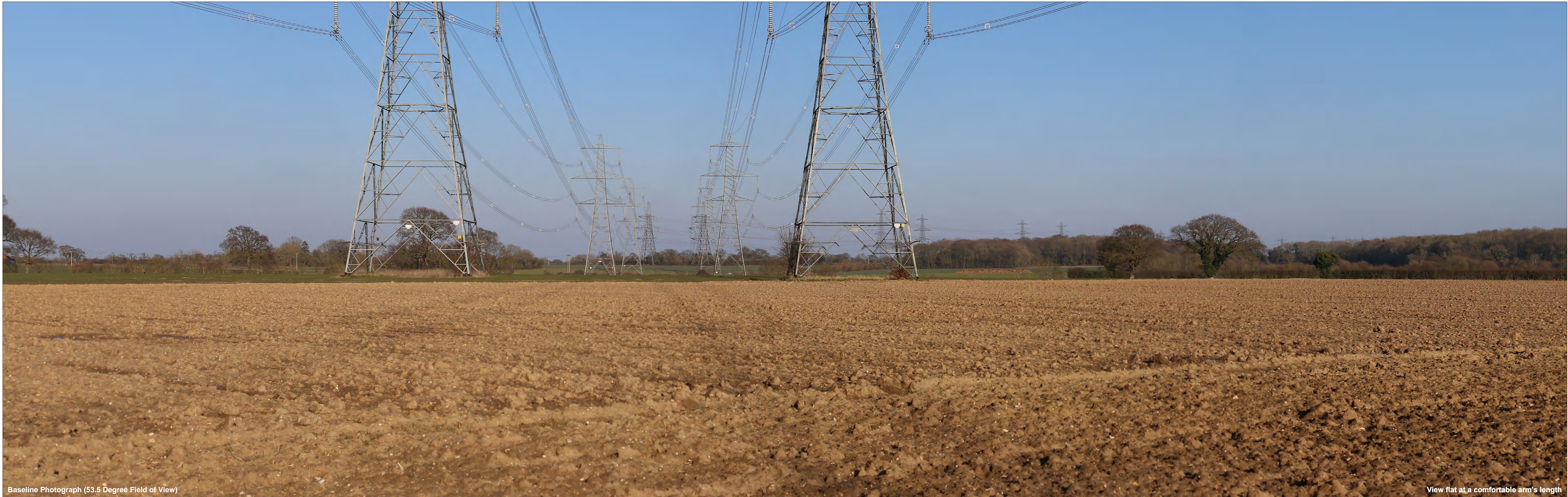
Baseline Photograph (53.5 Degree Field of View)